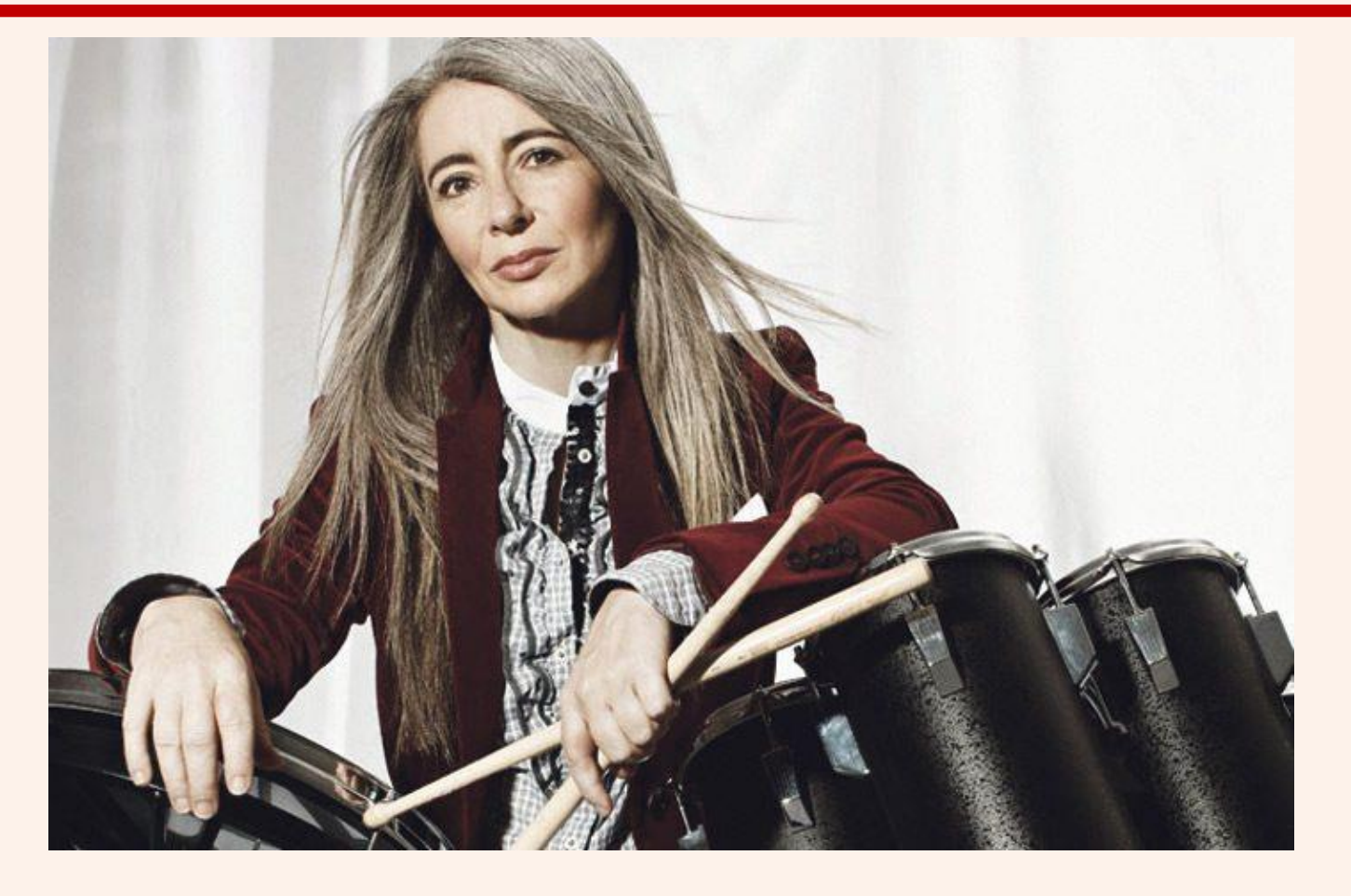
Evelyn Glennie (b. 1965) Percussionist