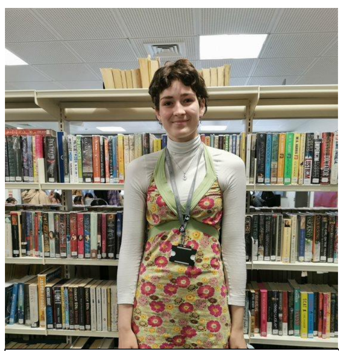
"We are hoping to give students the opportunity to build friendships, and create lasting memories while promoting inclusion and community spirit within the school."