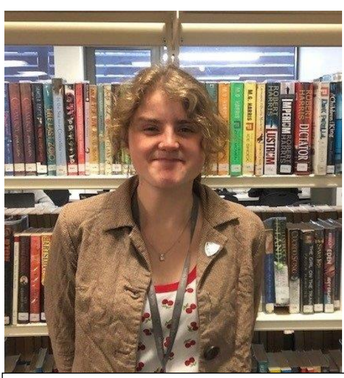
"I wanted to apply to be Leader of the Community Committee to support local charities, as well as enriching the school community and natural environment too."