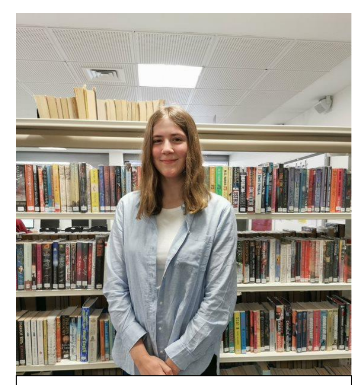
"As a House Captain, I would love to be able to help with the integration of different year groups through participating in House events!"