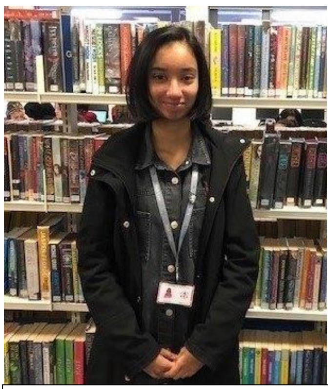
"We are planning to develop our new NCYW (National Council of Young Women) Society further to possibly involve other students from local girls' schools."