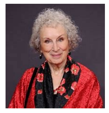
"An eye for an eye only leads to more blindness."