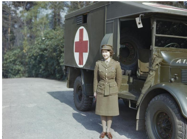
Queen Elizabeth in the Auxiliary Territorial Service, April 1945.