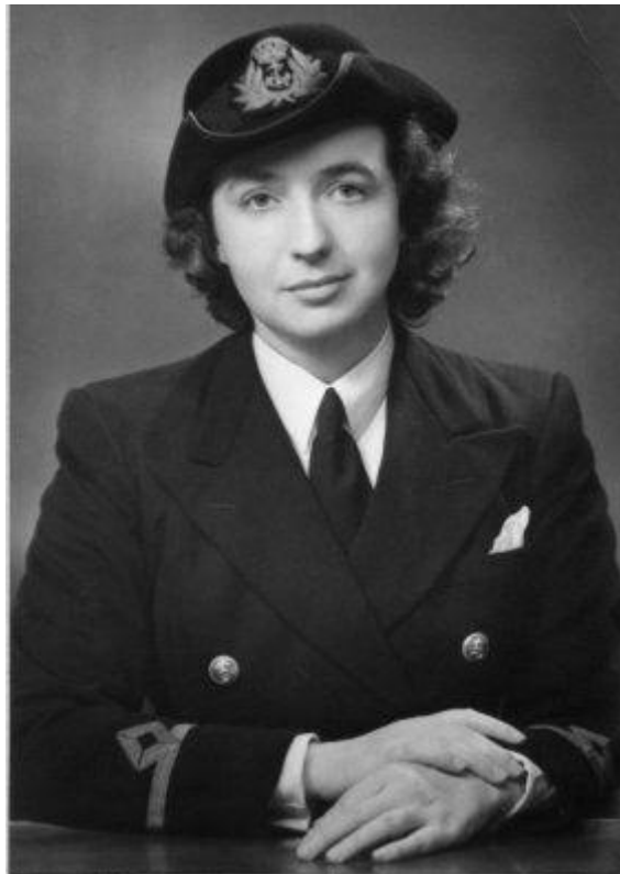
WNRS Officer Uniform.