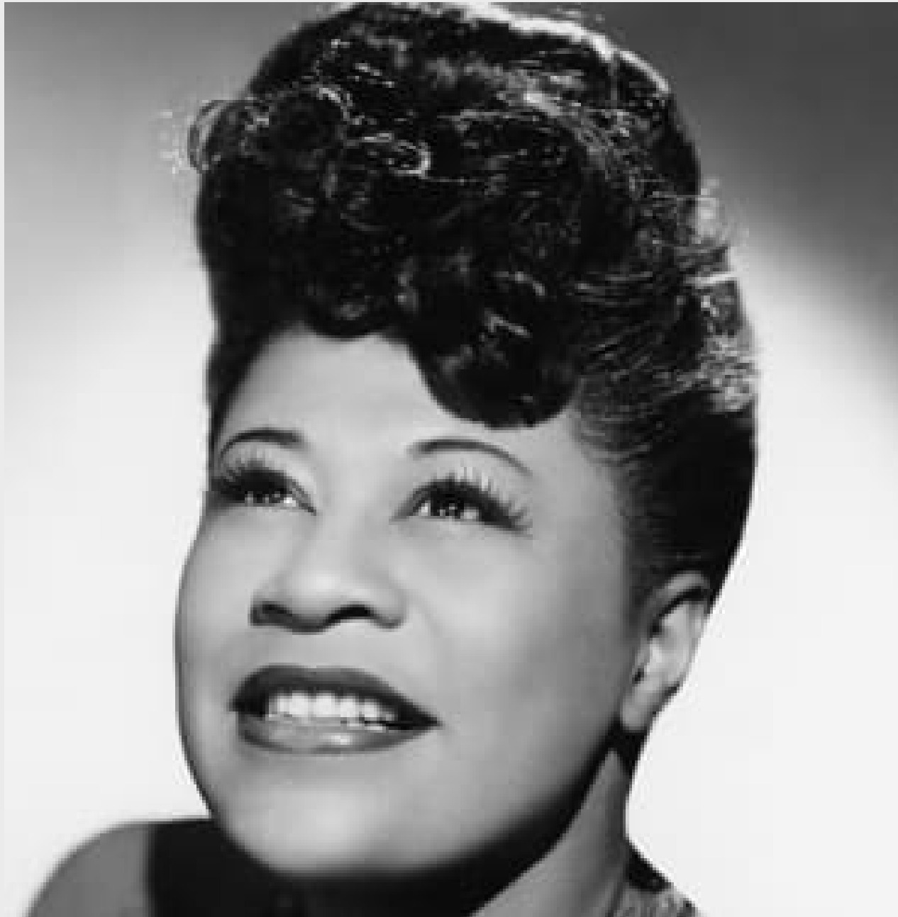
Ella Fitzgerald (1917 - 1996) Singer