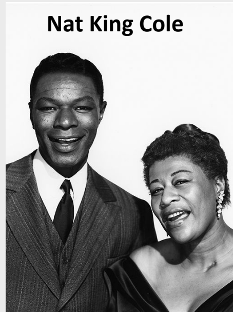
Nat King Cole

Her voice was flexible, wide-ranging, accurate and ageless. She could sing sultry ballads, sweet jazz and imitate every instrument in an orchestra. Fitzgerald also possessed a deft sense of swing, and with her brilliant scat technique, could hold her own against any of her instrumental contemporaries. She worked with all the jazz greats, from Duke Ellington, Count Basie and Nat King Cole, to Frank Sinatra, Dizzy Gillespie and Benny Goodman.