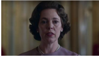
Olivia Colman as The Queen

The 96-year-old, was the UK's longest-serving monarch and despite hardly ever discussing women's rights, she had a watershed impact on empowering women everywhere throughout her reign.