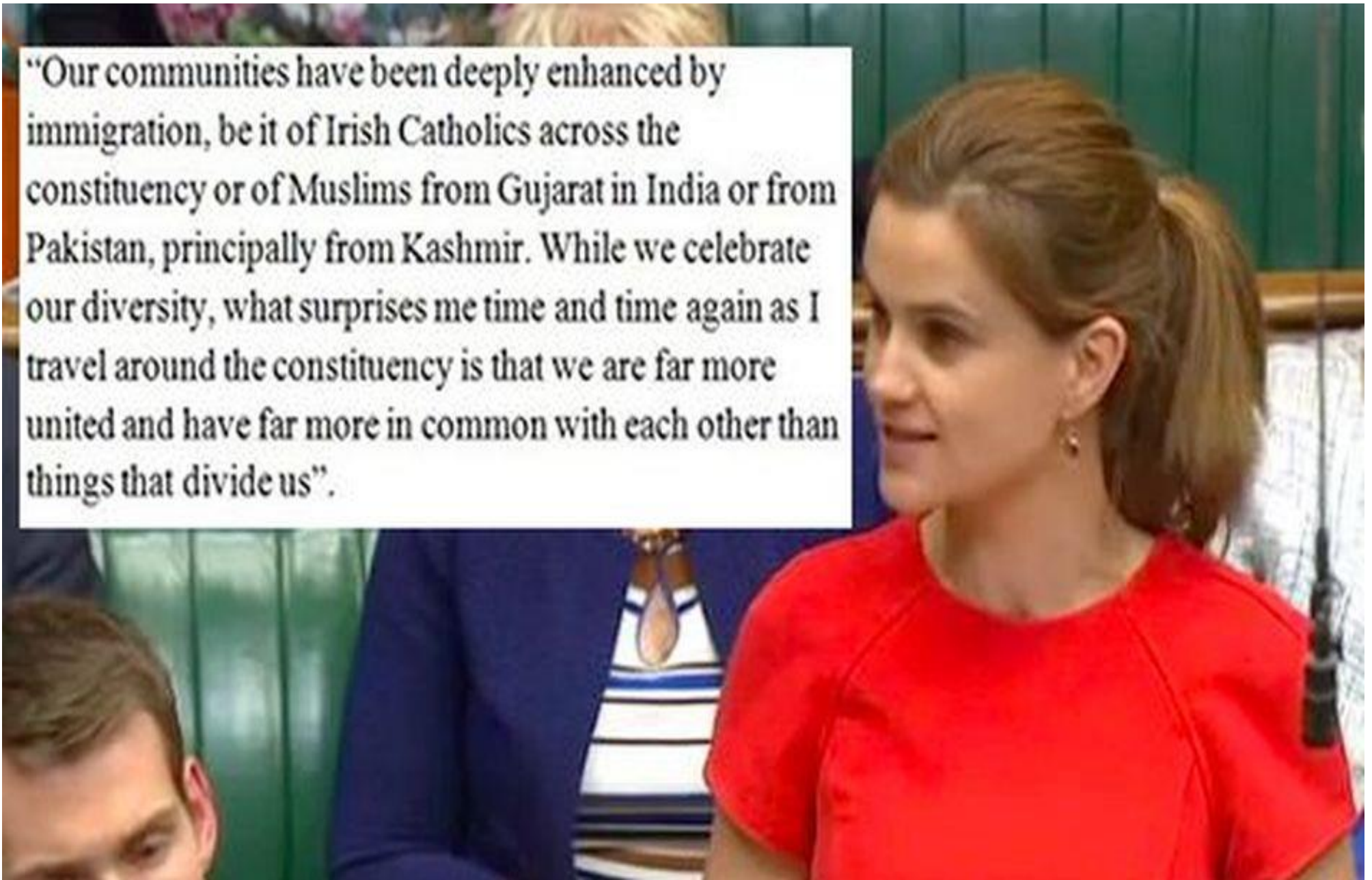
Jo Cox making her maiden speech in the House of Commons

“Our communities have been deeply enhanced by immigration, be it of Irish Catholics across the constituency or of Muslims from Gujarat in India or from Pakistan, principally from Kashmir. While we celebrate our diversity, what surprises me time and time again as I travel around the constituency is that we are far more united and have far more in common with each other than things that divide us”.