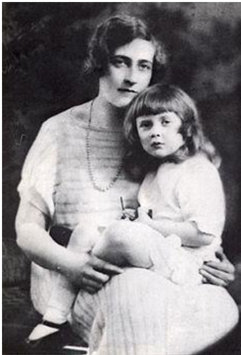
With Max Mallowan