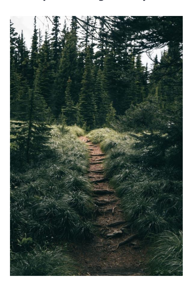
"We are writing history. What do you want it to say?"

Help the environment! And earn house points along the way!