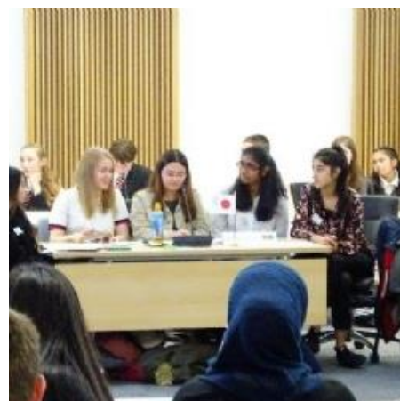
Model UN Climate Conference

At KS3 the overriding intent of the Geography Department is that students are engaged in the topics we study because they appreciate the relevance of what they are learning. They learn skills which better prepare them to understand the world in which they live; this ensures they are in a better position to make sensible decisions for their future, as well as having the understanding to empathise with different viewpoints. The KS3 curriculum is based upon the National Curriculum and has been carefully sequenced to ensure topics in Year 7 provide the building blocks for topics in Year 8 and 9 with retrieval practice built into the curriculum to ensure that knowledge taught is being retained. Those who choose to go on to study geography at KS4 are well prepared for their GCSE course. Feedback from students about their learning journey in geography is actively sought each year through focus groups and questionnaires; it is overwhelmingly positive and is used to further develop the curriculum and learning activities. A focus of recent years has been on introducing learning skills throughout KS3 with the aim that, having been exposed to many techniques by the end of the key stage, students are able to understand what works well for them and are ready to use these as they begin their KS4 and 5 courses.