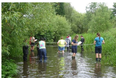
Year 10 River Chess Field Trip

We are a friendly and supportive department who work as a team with the aim of developing in our students a real interest in the world around them and a love of geography. We constantly strive to further improve the learning experience for our students by keeping up to date with educational research and reviewing our curriculum and schemes of work.